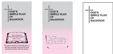
Minutes PTT Standard