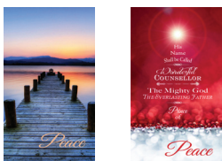
Peace Tract Peace Christmas