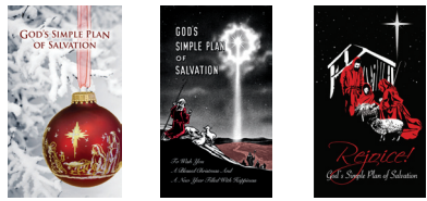
Ornament Shepherd Nativity