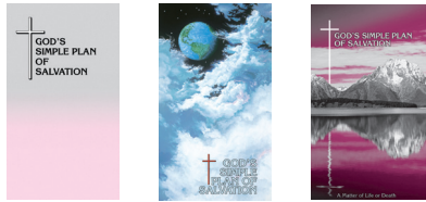
Deluxe Creation Large Print

(List quantity under the cover, 500 minimum each design)