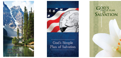
LP TRIFOLD IGWT Lily