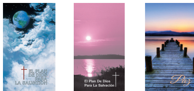
Span CRE Span DLX Span Peace